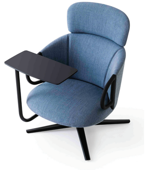
CUCARACHA HIGH BACK WITH TABLET ARM